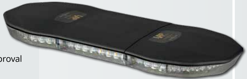
LAP2156AC - 540mm length