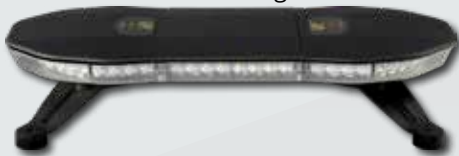
LAP2156AC - 540mm length